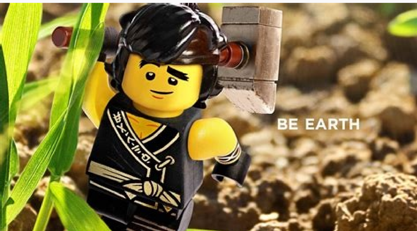
Lego ninjago shadow of ronin free download mod apk.